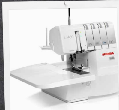
L 460 with slide-on table

The well-lit grand workspace of this overlocker eases sewing as well as threading of loopers and needles. Thanks to the Free-Hand System (FHS) that raises and lowers the presser foot both hands are free for sewing and placing the fabric. The slide-on table expands the work space to support larger sewing projects.