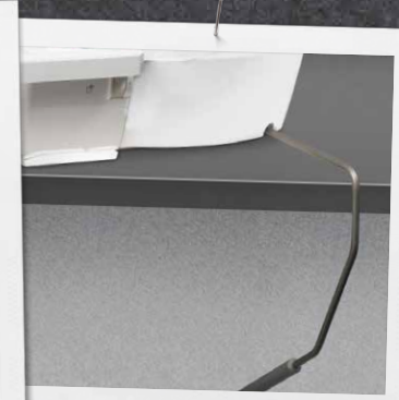
BERNINA Free-Hand System (FHS) for knee-operated presser-foot lift